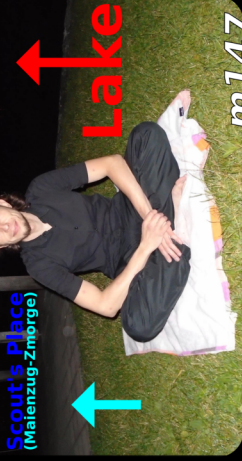
Scout's Place (Maienau-Zimorge)